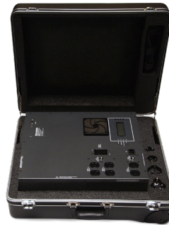
< 50 lb. Portable Briefcases