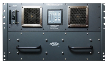
6U Rack Mountable