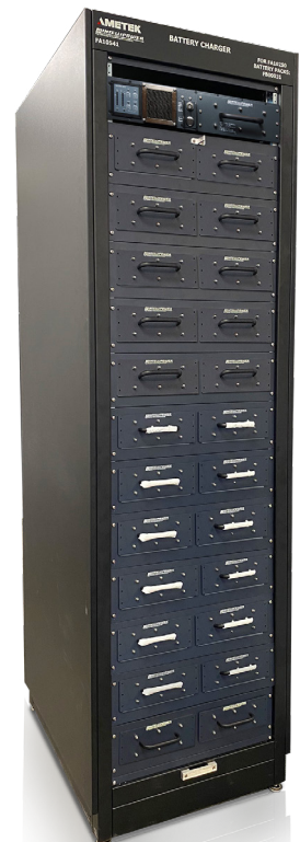
Free Standing Towers with Lifting Eyes