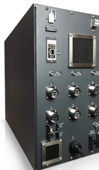
Wall or Bulkhead Mountable